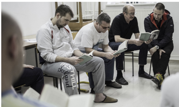
Reading as an essential part of the project in Maribor prison

The main thread of the programme and its activities is conveyed through stories featured in books by acclaimed Slovenian authors . Participants are introduced to these by a mentor (an established Slovene writer or poet).