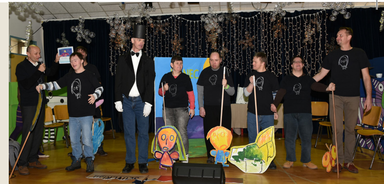
Theatrical performance of the group of people with mental disabilities at the end of the year-long programme

"Include and Activate!" has proven to be a good example of alternative work with a cultural content in which the concerned social groups are able to engage. The number of participants has risen every year so far. With a completion rate of over 80 % , it is clear that the project is also a hit with participants – all of whom have gone from reader to writer, and all of whom have shown empowerment in the field of artistic expression, as well as the competences crucial for employment and social inclusion (the presentation of oneself and its work, self-esteem, self-confidence and other new capacities).