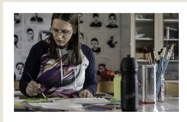
Illustration workshop as part of the project programme