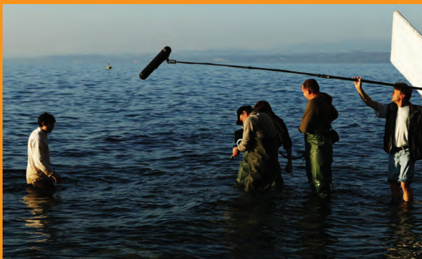
On the set of Piran Pirano