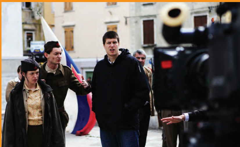
On the set of Piran Pirano : the director with two of the main characters.