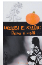
Koliko si moja? (How Much Are You Mine?), Študentska založba, 2011