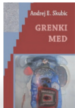
Grenki med (Bitter Honey), Litera, 2007