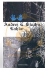
Lahko , (You Can) Študentska založba, 2009