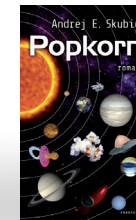
Popkorn , Croatian Edition, 2009