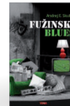
Fužinski blues (Fužine Blues, Serbian edition), 2008