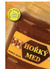
Hořký med (Bitter Honey), Czech edition, 2009