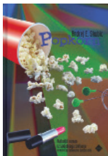
Popkorn (Popcorn), Cankarjeva založba, 2006

Translation Rights Contact Beletrina Academic Press Anja Kovač: anja.kovac@zalozba.org